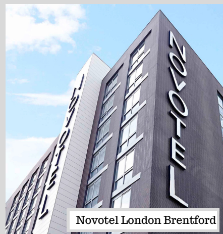
Novotel London Brentford

Welcome to London - the capital of the United Kingdom! This morning you'll be visiting The Cutty Sark in Greenwich, this historic sailing ship was the fastest of its time, now it's an award-winning visitor attraction. Whilst on-board you'll have the opportunity to explore the ship, take the helm, walk beneath the hull and even meet the crew. Once you've thoroughly enjoyed being aboard the Cutty Sark, only moments away is the Royal Observatory, here you'll find out how the Royal Observatory became the home of Greenwich Mean Time (GMT). Here lies the Prime Meridian of the world, this is where East meets West, stand either side of this line and you'll be in two hemispheres at one time. Following your visit you'll have a traditional pub lunch and return to central London via the Thames Clipper. Take in London's most popular sights from the river including the O2, the London Eye, the Tower of London and St. Paul's Cathedral. The remainder of the afternoon will be spent at leisure. In the evening you'll enjoy the theatrical delights of one of London's Musicals. Whether this is your first musical or you're on a regular theatre-goer you'll be captivated by the performances of the West-End. You'll be staying at the Novotel London Brentford for the next two nights, this hotel is located in West London, only a 5 minute drive from Kew Gardens.